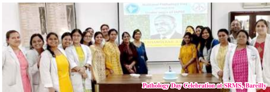
Pathology Day Celebration at SRMS, Bareilly