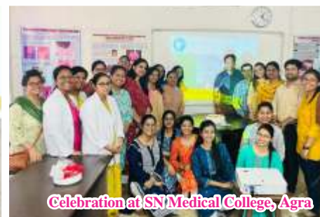
Celebration at SN Medical College, Agra