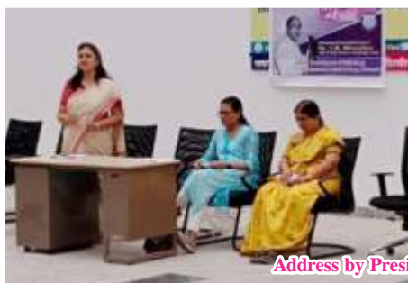
Address by President, IAPM at Govt. Medical College Baramati, Pune