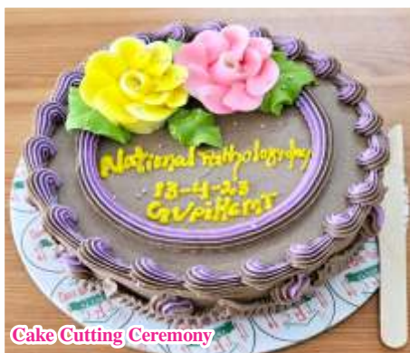
Cake Cutting Ceremony