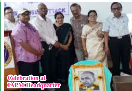
Celebration at IAPM Headquarter