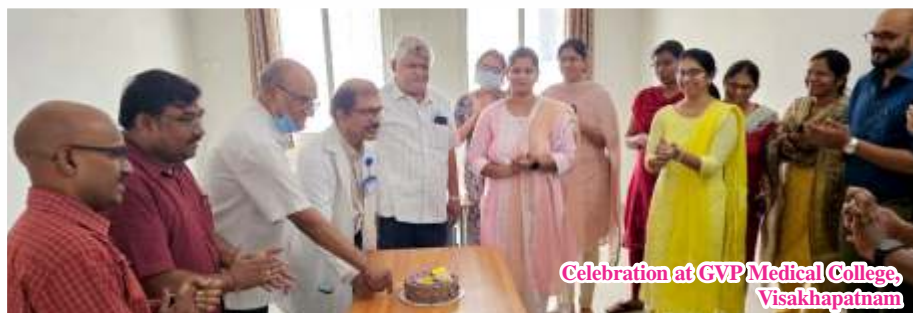
Celebration at GVP Medical College, Visakhapatnam